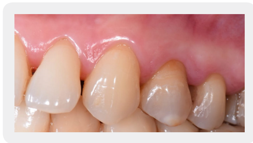
Figure 2b: Pictures after treatment with placebo. Gingival tissue appears pink without edema.