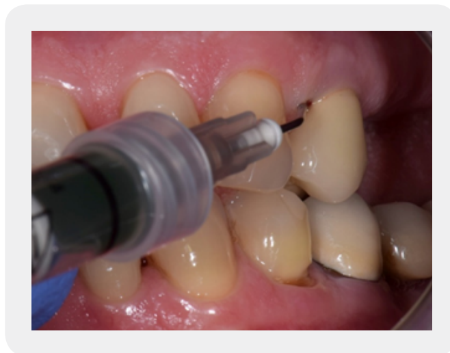
Figure 1: Local delivery of spermidine gel into the periodontal pocket.